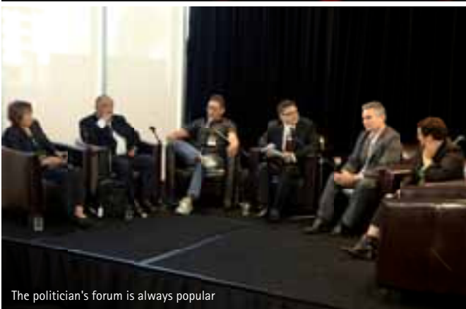
The politician's forum is always popular

In his speech the Minister noted "my ministry Te Puni Kōkiri has supported this event since its inception because it saw the potential to reach this audience and because of its aim to inspire young people about their career and study choices. I'm pleased about the support given because events like this are very much about a vision for our future where Māori enjoy