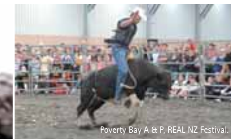
Poverty Bay A & P, REAL NZ Festival.