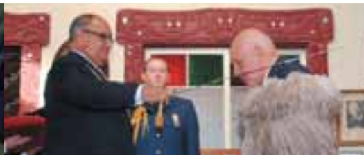
SIR TĀMATI KNIGHTED AT HOME