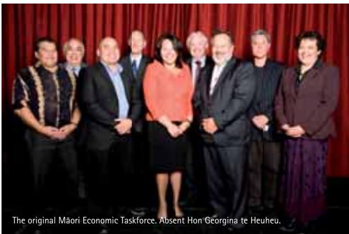
The original Māori Economic Taskforce. Absent Hon Georgina te Heuheu.