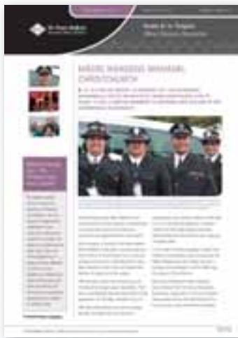
Māori Wardens Newsletter - June

Select Committee Inquiry into Māori Community Development Act