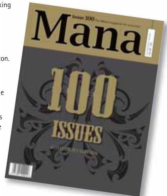
Mana magazines 100th cover

Mana magazine survives by selling advertising and magazines. All three of these entities are privately owned.