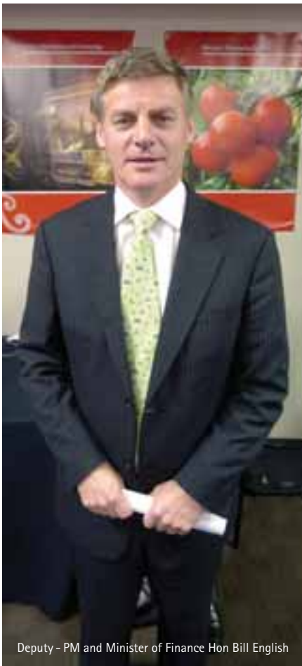
Deputy - PM and Minister of Finance Hon Bill English

Focussing on the future and building on the work of the Māori Economic Taskforce, Minister Sharples announced his intention to develop, in concert with Māori and government, a Māori Economic Strategy.