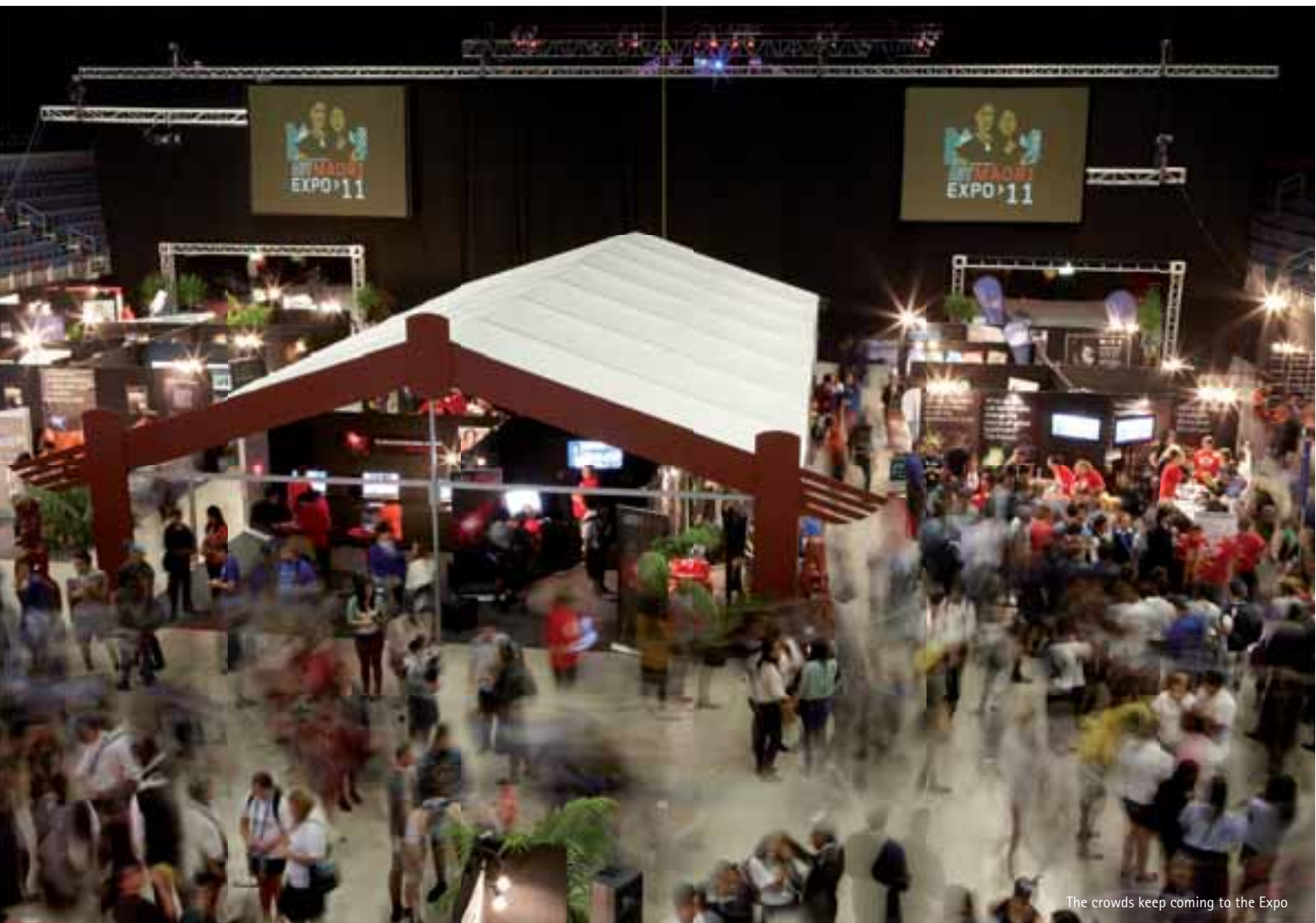
The crowds keep coming to the Expo