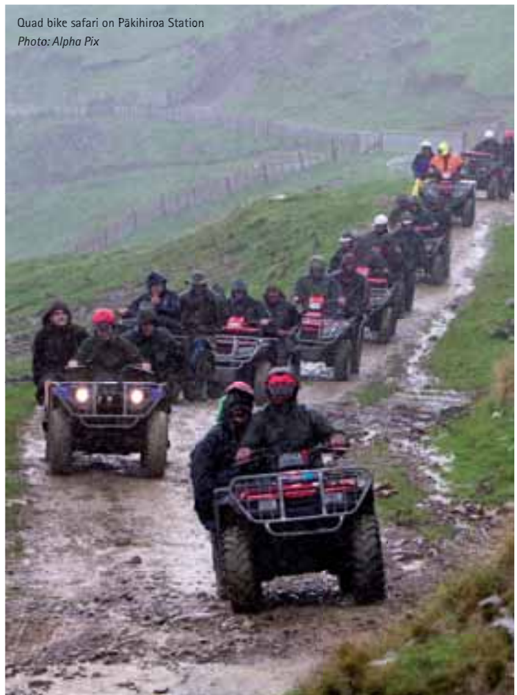
Quad bike safari on Pākihiroa Station

The farm has implemented an effective erosion control strategy and its plantings are a major part of land retention – with erosion such a major problem on the East Coast.