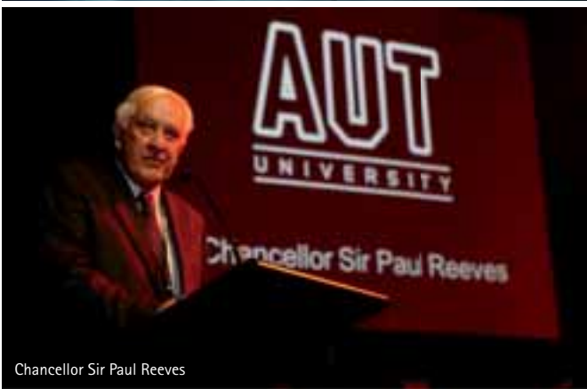
Chancellor Sir Paul Reeves