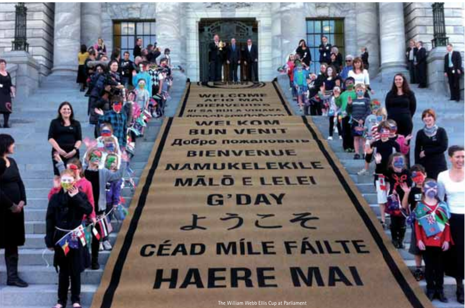
The William Webb Ellis Cup at Parliament

"A long time ago the New Zealand Government and tournament organisers agreed that key to the success of the tournament is their promise that RWC 2011