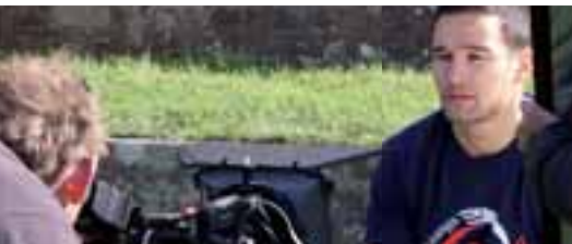
TE AO MĀORI