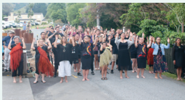
Ngāti Wheke welcoming the Tuia 250 crews.