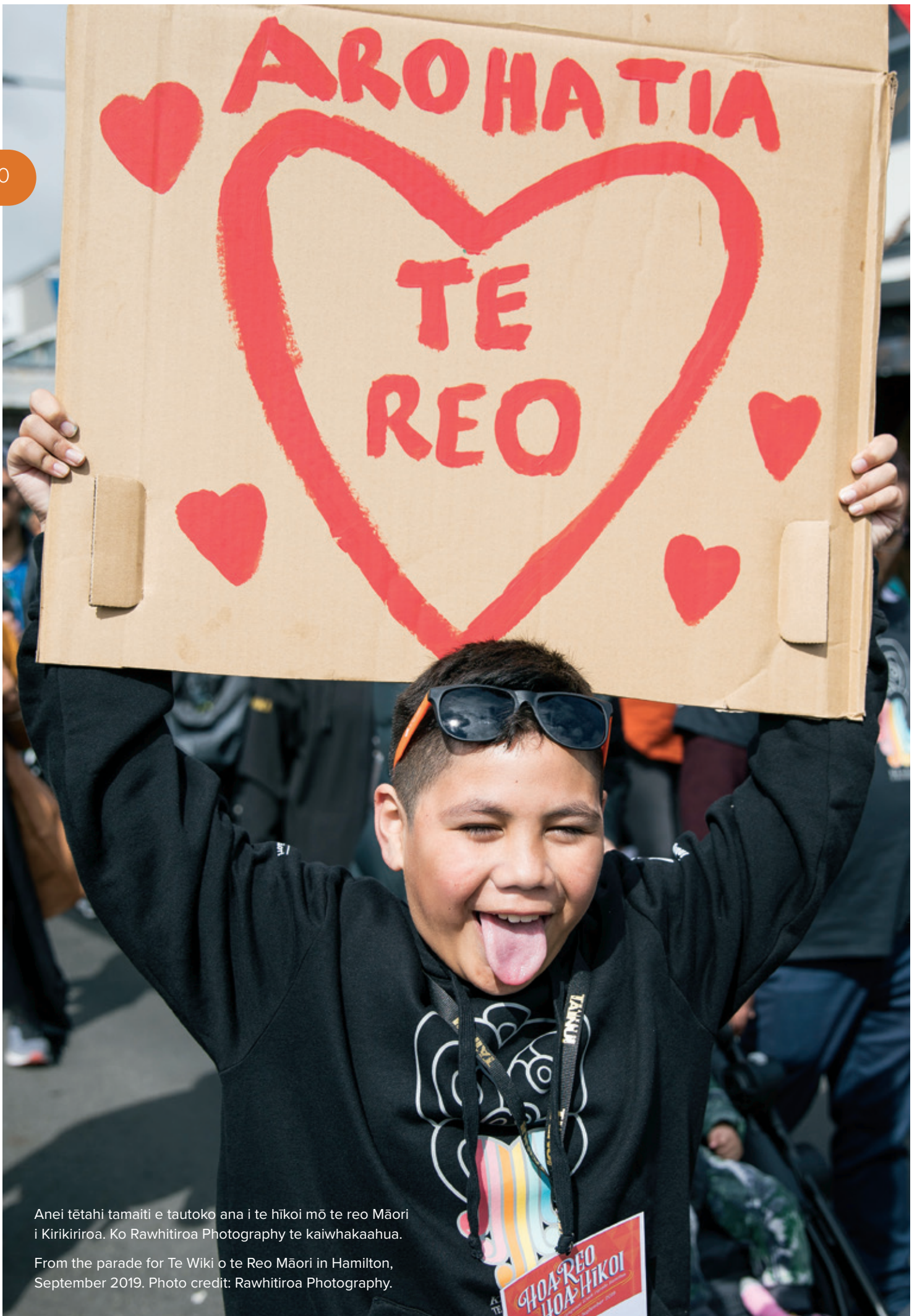
Anei tētahi tamaiti e tautoko ana i te hīkoi mō te reo Māori i Kirikiriroa.

From the parade for Te Wiki o te Reo Māori in Hamilton, September 2019.