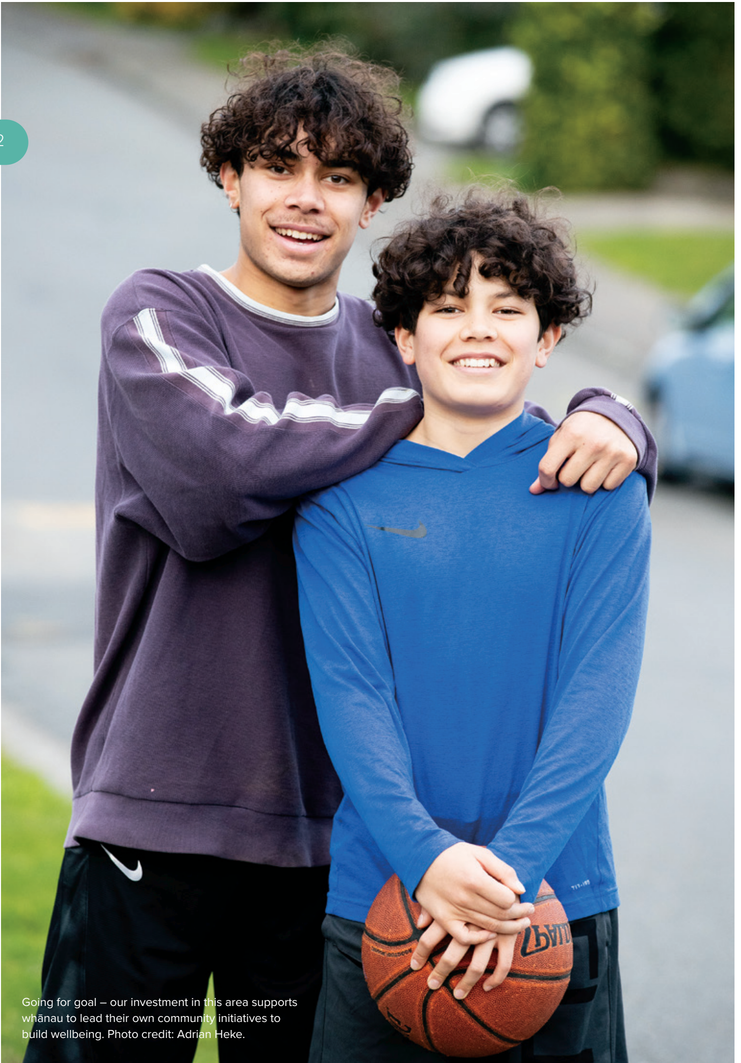
Going for goal – our investment in this area supports whānau to lead their own community initiatives to build wellbeing.