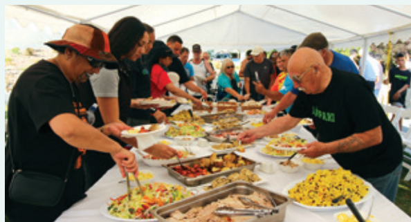
Celebrating with kai to welcome the waka hourua crews for Tuia 250.