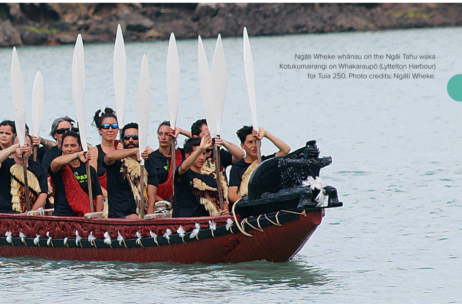
Ngāti Wheke whānau on the Ngāi Tahu waka Kotukumairangi on Whakaraupō (Lyttelton Harbour) for Tuia 250.

A waka research project is also underway, which includes close participation by whānau.