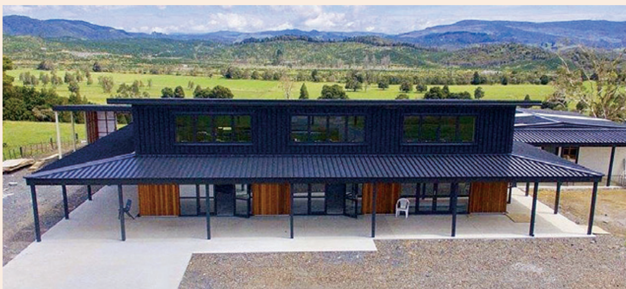
The new wharekai at Ōkorihi Marae, the heart of a visionary rebuild after a fire in 2003.

“He was so happy. Which means in the end, we had done our job.”