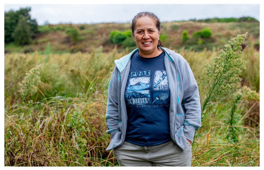
Above: Supporting whānau to achieve their whenua aspirations.

The inability to access landlocked land prevents land owners from using their land. Currently, the factors that the Māori Land Court must take into account when granting an order for reasonable access to landlocked Māori land are too restrictive. The Bill enables the Court to take account of a broader range of factors and, by doing so, will help whānau gain access to land that until now they have been alienated from.