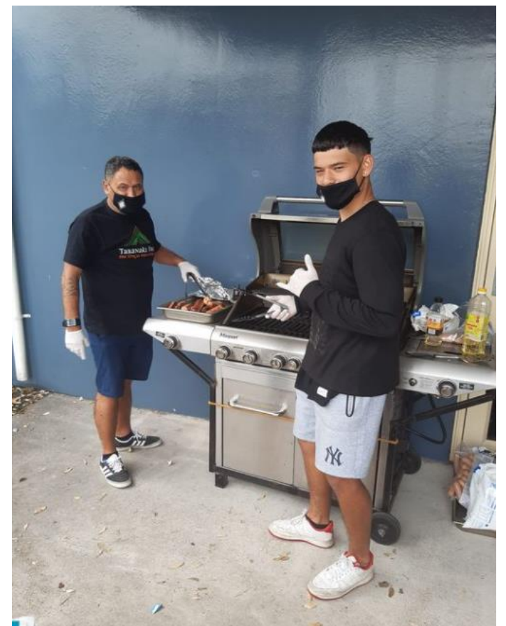
Above: The CEO of Tui Ora and his son keeping whānau well fed at one of Ngā iwi O Taranaki Collective's vaccination clinics held in Ōpunakē.