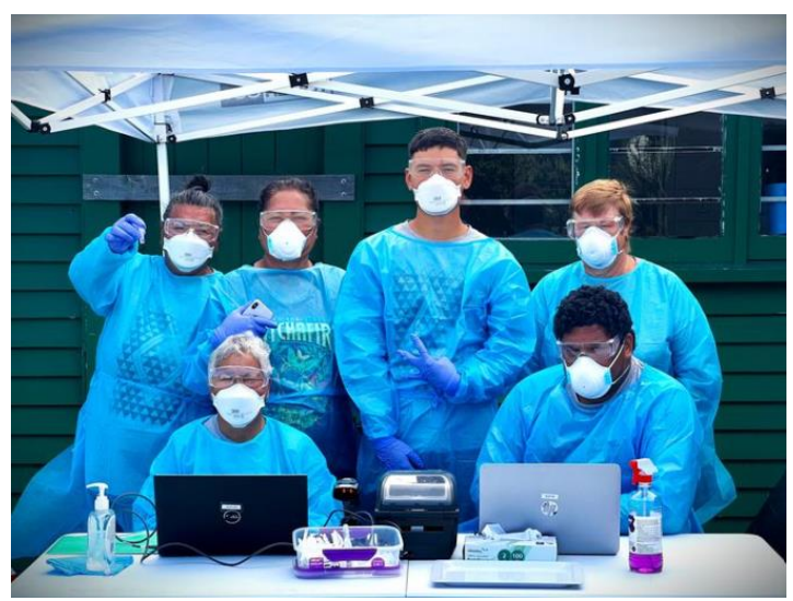
Above: Ngā iwi O Taranaki Collective's team at one of their drive in testing centres.

MCCF Communications update Developing messaging for kaimahi and kaitono to prepare for completing fund activities Presenting the Karawhina Initiatives at the 2 day Iwi Communications Collective annual meeting in Rotorua.