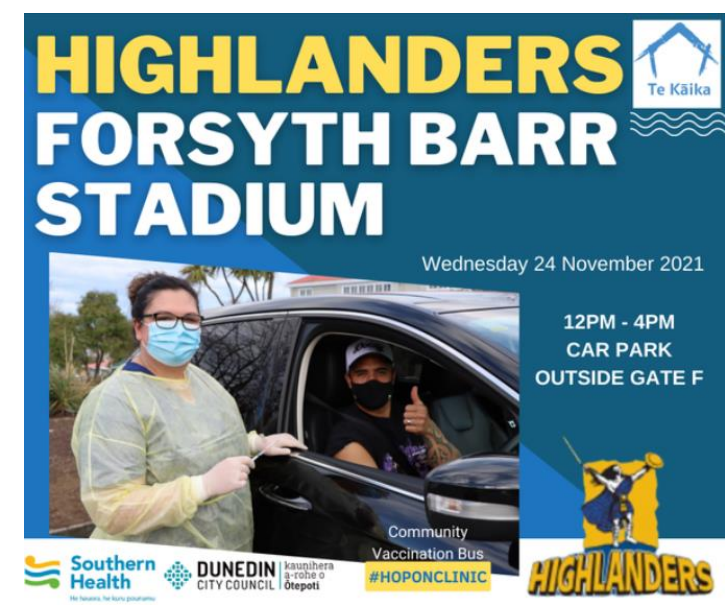
Above: A meet and get vaccinated with the Highlanders event held by Ōtākou Health Limited.