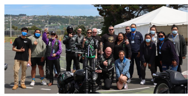
Above: RATS Otago (Riders Against Teen Suicide) stopping by at one of the Ōtākou Health Limited drive through clinics to get vaccinated.

MCCF Communications update Developed communications on the current status of Phase 3. Briefing the Iwi Comms Collective on opportunities to access the fund. Recruited a specialist to establish Karawhiua tāngata whaikaha and tāngata whaiora workstreams. Soft launch of new PCR and RAT test interactive map on the Karawhiua website. Further Google and Facebook sponsorship confirmed. New school holiday whānau vaccination ads.