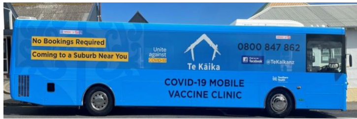
Above: The 'hop on clinic' was offered by Ōtākou Health Limited to take vaccination services out to communities in need.