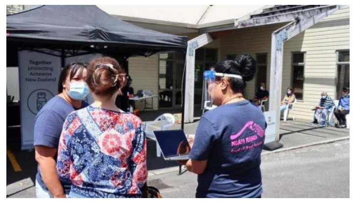
Above and below: Te Ranga Tupua mobile vaccination teams at work.