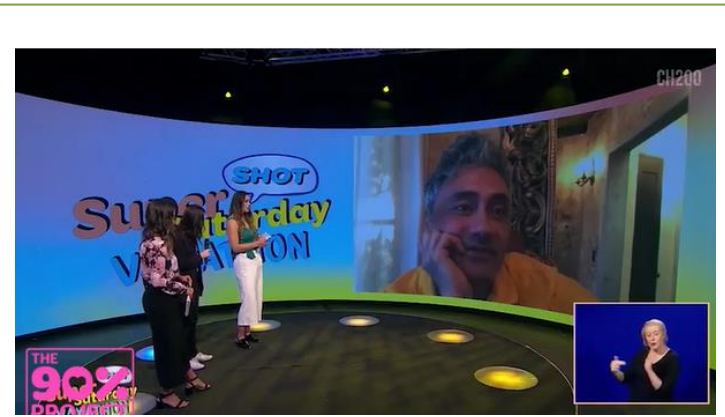
Above: The Pango Productions team helped get trusted information out to the community by assisting with the filming of events like the Super Saturday Vaxathon.