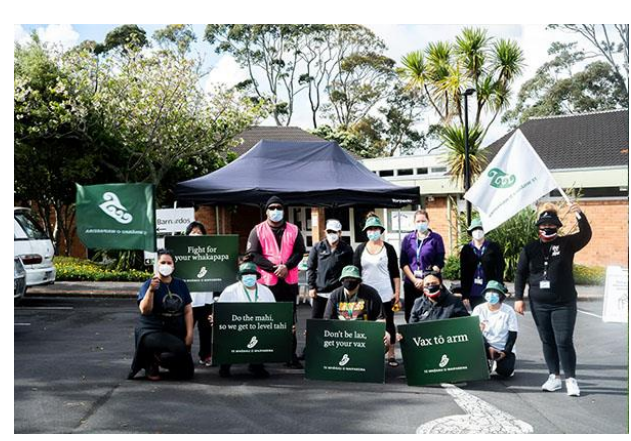
Waipareira kaimahi have been engaging whānau Māori on multiple fronts to get Tāmaki Makaurau and Northland vaccinated.