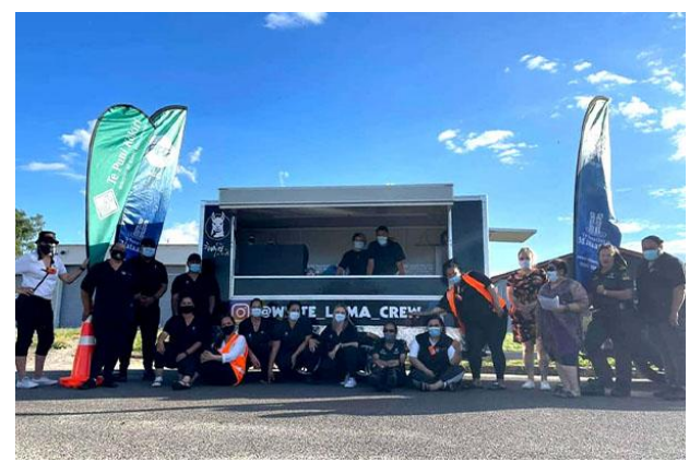
Kaimahi from Te Ika Whenua Hauora, Te Puna Ora o Mataatua and Te Puni Kōkiri support a Thursday drive-through in Murupara.