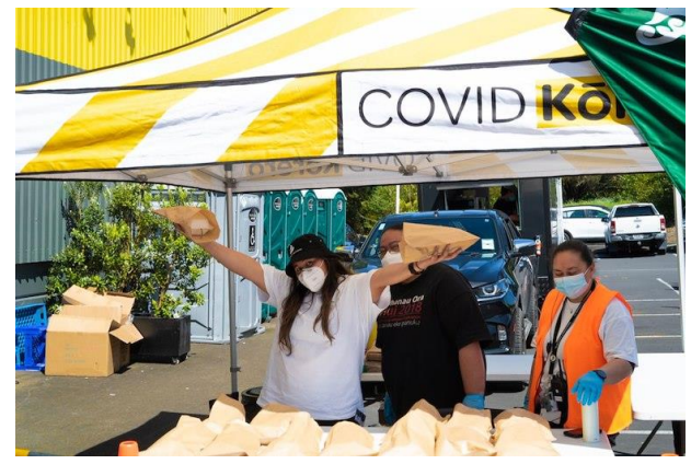
Whānau Waipareira kaimahi giving kai at an event to encourage kōrero about the vaccine and offer vaccinations