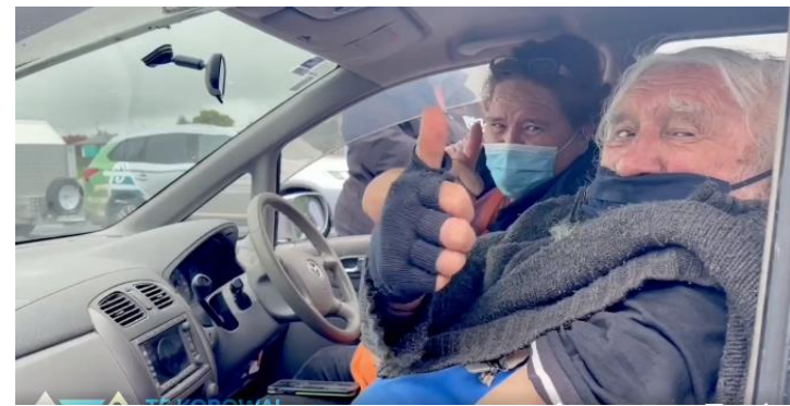
Above: Whānau from Paeroa happy to receive their vaccine without having to enter a building.