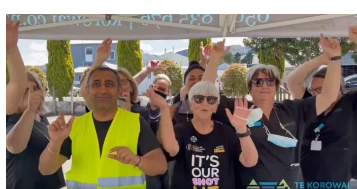
Above: The Te Korowai team celebrating a successful day at one of their vaccination clinics held in Waihi.

MCCF Communications update Identifying ways to align the MCCF and Karawhiua programmes to support Karawhiua initiatives. Developing key messaging around fund size and impact on vulnerable communities from cessation of MCCF activities at 30 June.