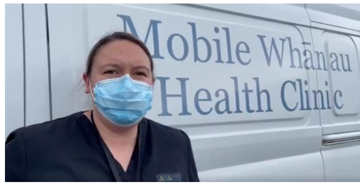
Above: Te Korowai taking their mobile vaccination and testing services out to communities in need.