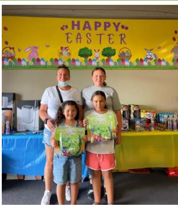
Above and Below: A special Easter themed vaccination event held by Taumarunui Kōkiri Community Trust.

MCCF Communications update Shooting new video series about regional COVID-19 stories, in Waiohau UX focus groups underway for Karawhiau website refresh Contracted new marketing advisor to help deliver the current marketing surge DPMC will contribute to a Karawhiau Matariki campaign on TV, digital and out of home channels