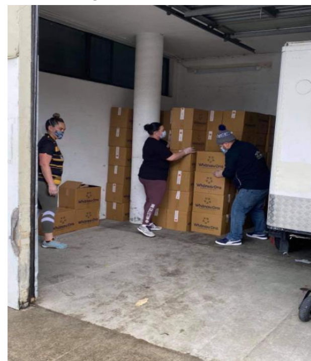
Above: The Ngāti Ruanui team preparing to deliver sanitation packs to whānau.