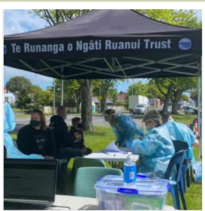
Above: One of Ngāti Ruanui 'Vax 'N' Yaks' pop up vaccination clinics.