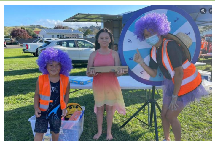
Above: Tamariki receiving prizes as they spin to win at one of the pop up vaccination centres set up by Turanga Health.