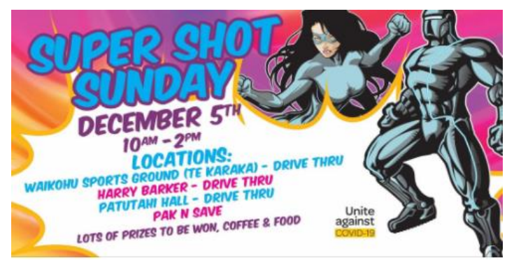
Above: An example of Turanga Health's advertising to encourage whānau to get vaccinated.