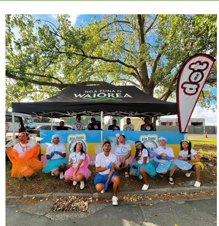
Above and below: Ira Dot Fairies from the Ira Dot campaign, supported by Ngā Puna o Waiorea. Kaimahi worked to provide information on vaccinations and encourage whānau to 'get dotted'.