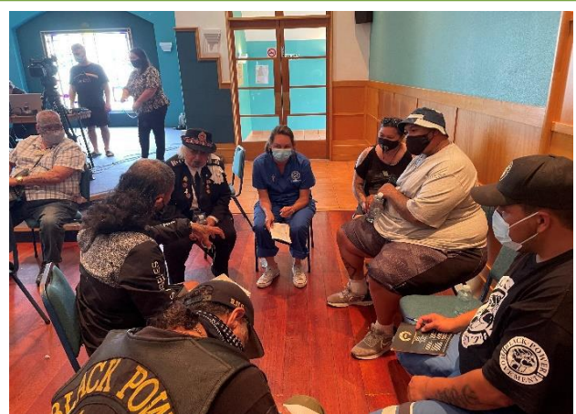
Takitimu warden facilitating a workshop session with Black Power members and health care workers.

MCCF Communications weekly report MCCF webpage updated Phase 1 & 2 and how MCCF sits within AOG response to COVID-19, shared across agencies. Kokiritia e-news a Covid survivor and MCCF update. Karawhiua e-news Turanga Health's Karawhiua mobile van and Minister Jackson's praise for iwi radio in vax drive. Funding granted for Karawhiua campaign will see new MCCF digital social media and video content developed. Auckland disabled whānau reach 90% vax rate. Taikura thanks Te Puni Kōkiri for funding.