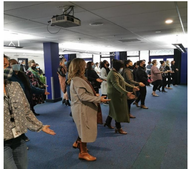
Staff from Te Taiwhenua o Heretaunga welcome waiata to the wardens at the ceremony.