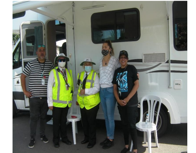
Takitimu Wardens with Te Taiwhenua o Heretaunga kaimahi on deployment in Camberley.