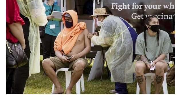
Whānau in Te Tai Tokerau attending vaccination events