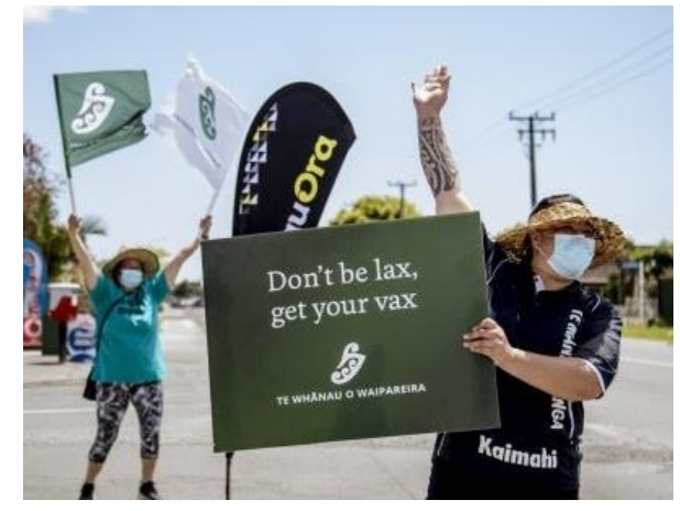
Whānau in Te Tai Tokerau attending vaccination events