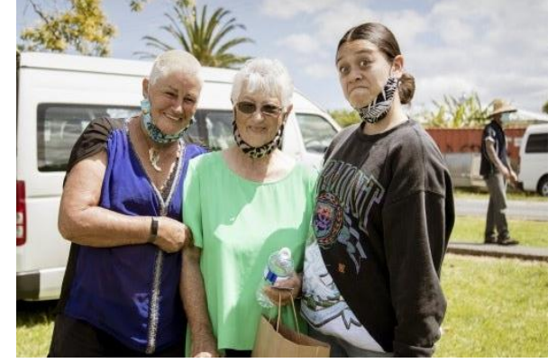
Whānau in Te Tai Tokerau attending vaccination events (Photos from Stuff)