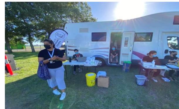
On Wednesday 22 December 2021, the Shot Cuz Rangatahi Team promoted and held a whānau vax drive-in movie night for all whānau to attend at the Whanaanui Function Centre Racecourse carpark.