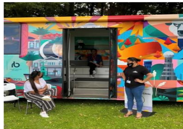
The Whanganui mobile clinic set up at Aramoho Top 10 Holiday Park on 21 Dec 2021