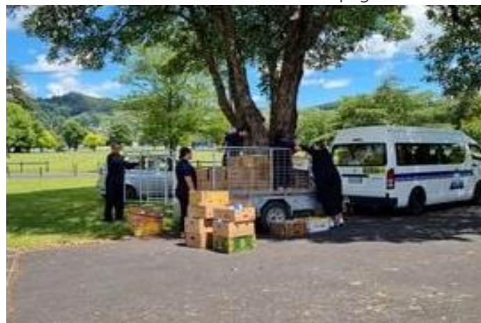
Above: Volunteers for Waikato Tainui preparing to take support packs to whānau in response to local cases of COVID-19 in the Waikato area.