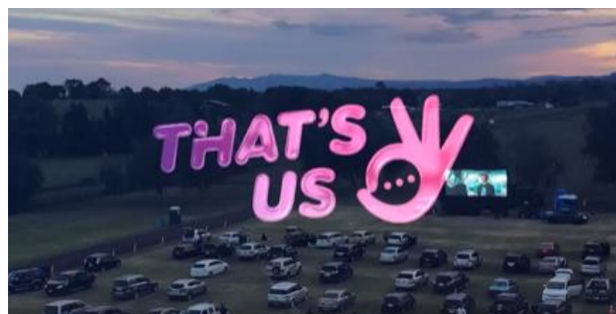
Above: One of Waikato Tainui's campaigns to encourage whānau to get vaccinated while enjoying a night at an outdoor movie.