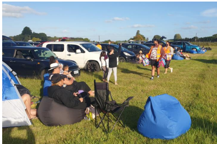
Above: One of the drive-in vaccination and movie events hosted by Waikato Tainui