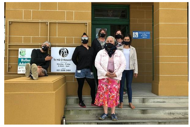
Te Hā o Kawatiri and NBS theatre kaimahi at the Karawhiua Kawatiri event for the Buller district, offering free hāngī, coffee and cash prizes.