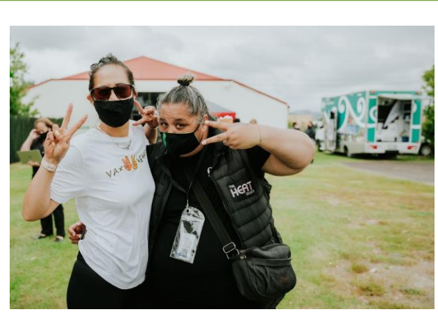
Organisers at a Vax Vegas vaccination event

MCCF Communications weekly report MCCF webpage updated: Ministers approved $70.148m with 83 kaitono over 44 proposals and providers can expect news on Phase 2 soon. Listed contracted providers. Facebook and LinkedIn reposts of $70.148m approved and Māori health providers vaccinated over 152,000 Māori, a 54.7% increase, twice the national increase of 27.1% since October 6. Media are generally giving positive coverage of MCCF provider activity. TPK published " Vax Vegas " and " Getting the South Island Vaccinated. " Waitangi Tribunal hearing on Covid response received media coverage regarding criticism of slow response for Māori. Providers are wanting more information on when will Phase 2 open and criteria.