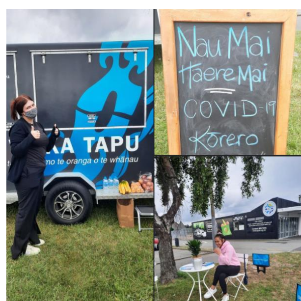
He Waka Tapu kaimahi at the Hampshire Community Centre in Ōtautahi.