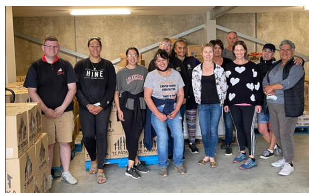
Kaimahi of Te Kotahi o Te Tauihu. Received $250,000 to uplift vaccination rates in Te Tau Ihu with a focus on rangatahi, including operating a mobile clinic.