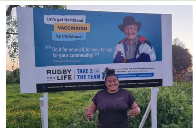
Promotional material for the "Take two for the team" promotional campaign

MCCF Communications weekly report Social media team posting on TPK's Facebook and LinkedIn re vaccinations progress in low vax regions, successful rangatahi vax initiatives and sharing whānau plan information Over the next week TPK and Karawhiua will use their channels to profile: Tairāwhiti hauora providers which gained MCCF funding, making traction by hitting low-vax neighbourhoods Vax Vegas – an MCCF funded rangatahi initiative in Rotorua Karawhiua is working with Te Amokura to produce regionalised 'hearts and minds' videos of vaccinations and iwi/whānau COVID-19 readiness initiatives that include profiles of MCCF recipients