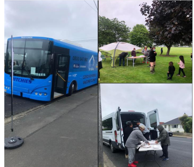
Kaimahi from Te Roopu Tautoko ki te Tonga, working with Te Kāiāka to provide pop-up vaccination services in Mosgiel