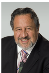
Hon Dr Pita R Sharples Minister of Māori Affairs

Before progressing further with these propositions, it is important that the Panel tests its thinking by obtaining feedback from landowners themselves, and those with an interest in Māori land and Māori land development. We hope you take the opportunity to read this discussion document and provide the Panel with your views.