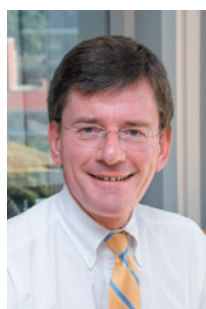
Hon Christopher Finlayson Associate Minister of Māori Affairs