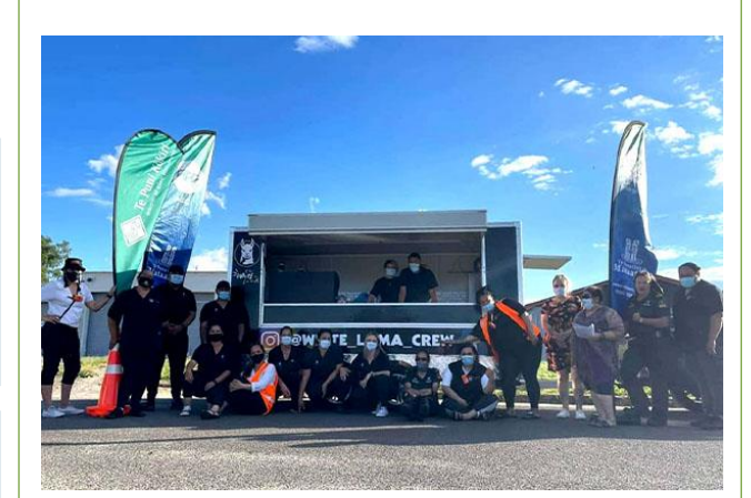
Kaimahi from Te Ika Whenua Hauora, Te Puna Ora o Mataatua and Te Puni Kōkiri support a Thursday drive-through in Murupara.