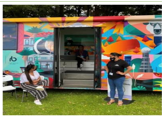
The Whanganui mobile clinic set up at Aramoho Top 10 Holiday Park on 21 Dec 2021